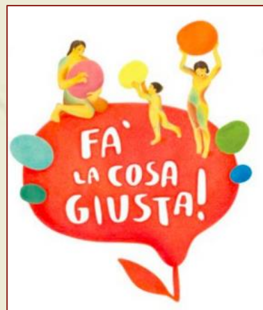
Fa' la cosa giusta 📍 Milan