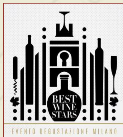
Best wine stars 📍 Milan